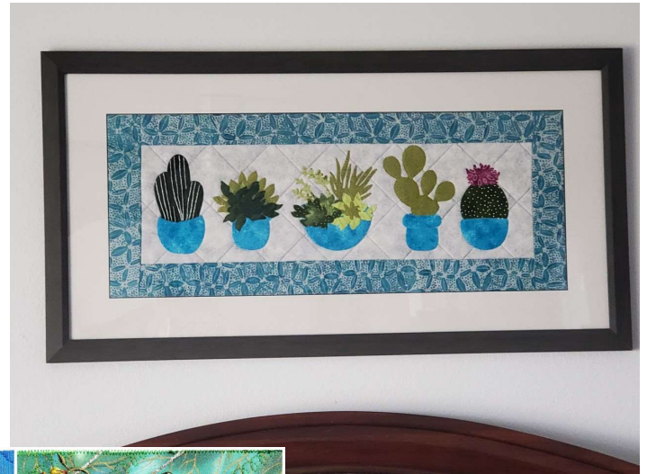
Karen Crowson (right) This was my solution when I couldn't find a picture or wall art for our bedroom.