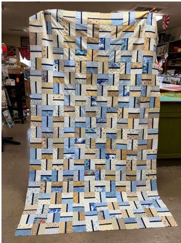
Chain link with scrap batiks