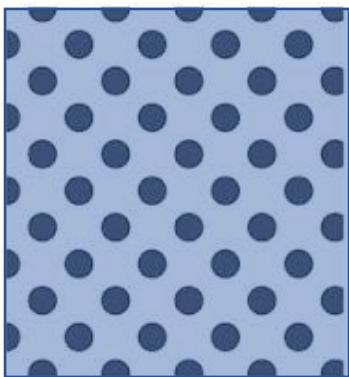
Dots in a Half Drop Repeat

There is no recorded history as to how polka dots got their name, but folklore speculates it may be derived from the Czech word pulka meaning half, a description of the jumps (or half-steps) taken in the dance. Barbara Brackman goes even further to speculate that this also explains the half drop repeat of the polka dot pattern itself as opposed to the full drop repeat, which she refers to as a dotted fabric 1 , not a true polka dot. Who knew?!