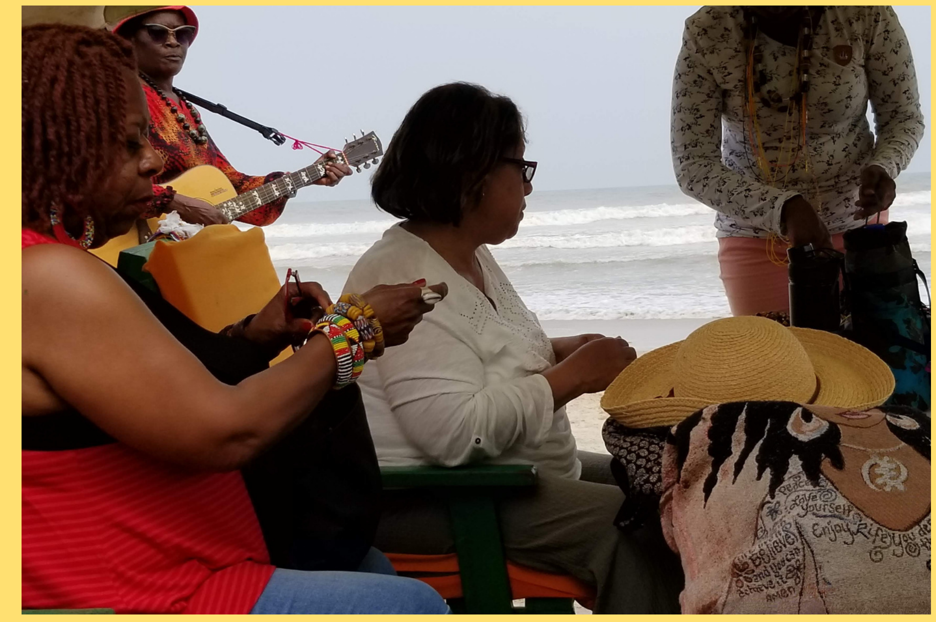
Relax on the Beaches of Accra & Cape Coast