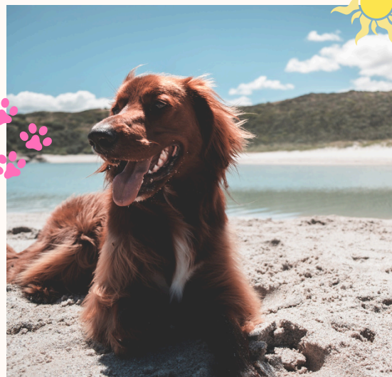
Life's too short for dry paws!

Keeping these simple tips in mind will set you and your pup up for a risk-free and enjoyable summer to create all those sunny memories together in the sun!