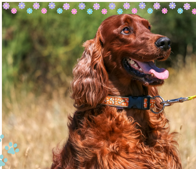
Everything is better with a dog and the summer sun

Thank you for tuning into this newsletter and supporting HFB so far this year, as always ~ happy reading!