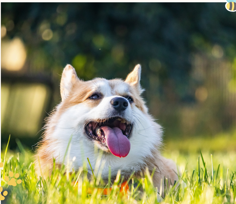
Sunshine, belly rubs, and good vibes only

Our educational section for this newsletter, 'A breath of fresh air' , follows the change of the season , with everything you need to know about preparing your pets for the springtime, so that you and your furry friends can make happy memories together this season! To finish off the newsletter, we have our 'discounts in bloom' , including some special offers at HFB this month! Thank you for tuning into this newsletter and supporting HFB so far this year, as always ~ happy reading!