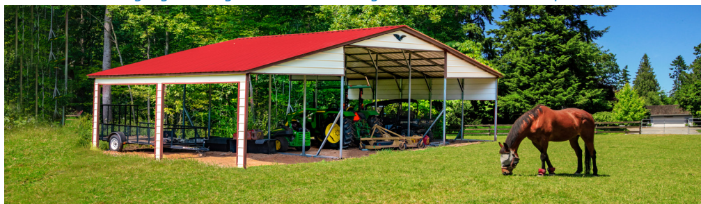
Image shown features additional options not included in base price.

Note: 12 gauge framing available, must charge center and lean-to's as separate units.