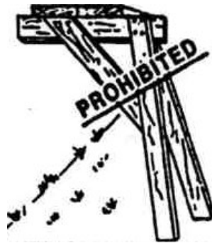
LEAN- TO SCAFFOLD