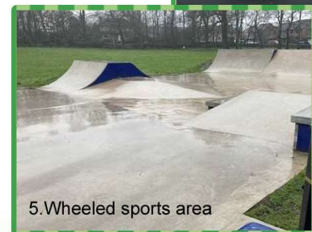
5. Wheeled sports area