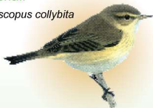
Chiffchaff Phylloscopus collybita