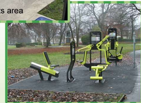
6. Outdoor gym