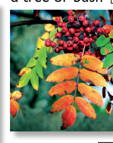
Red berries on a tree or bush