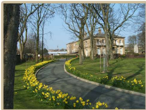
Spring at Gatty.

is a small park, a 12 minute walk from Accrington town centre off Hyndburn Road near to the Asda. It is a nice place for a picnic on a fine day, picnic tables are available!