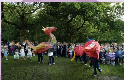
Pop along, you never quite know what you'll find!