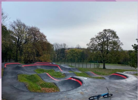
Something for everyone