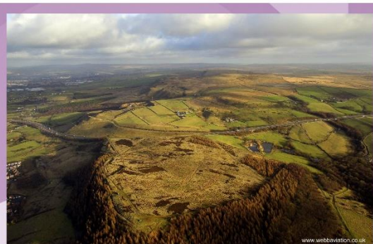
Peel Park and the Coppice, the largest park in the borough and the largest Local Nature Reserve in the whole of Lancashire!