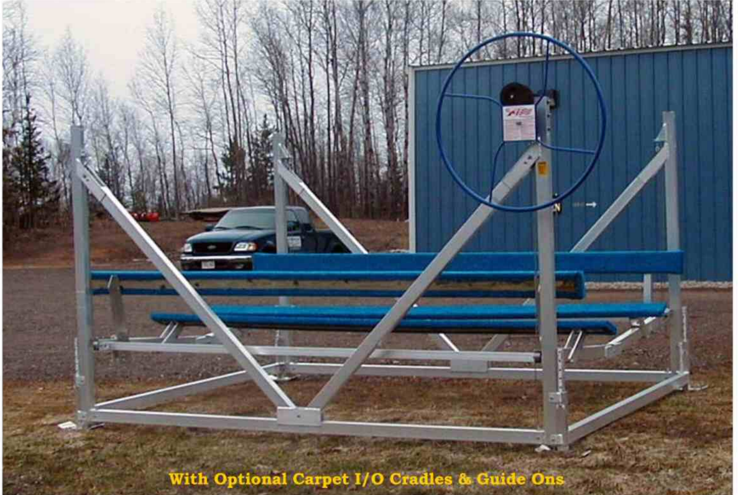
With Optional Carpet I/O Cradles & Guide Ons