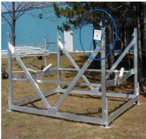
Optional Padded Cradles