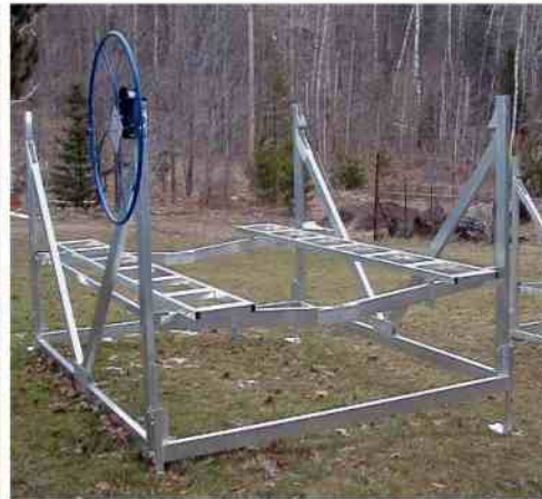
Optional Pontoon Cradles