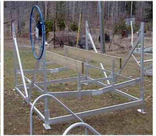
Optional Pontoon Rails