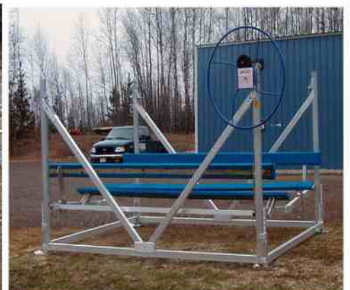
Optional Carpet I/O Cradles & Guide Ons