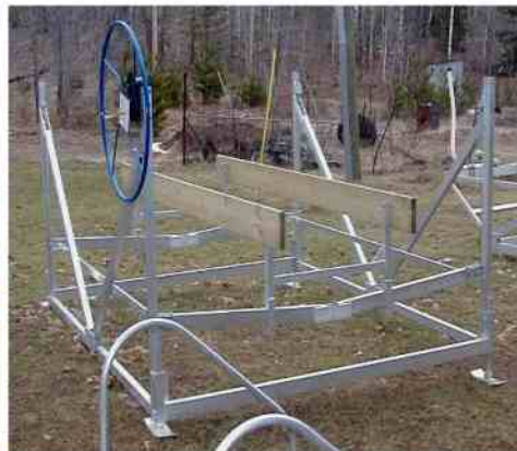
Optional Pontoon Rails