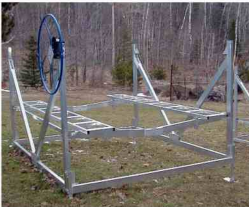
Optional Pontoon Cradles