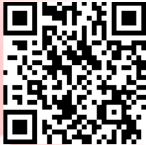
Scan For Obituary