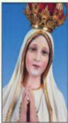
Nuestra Señora de Fátima