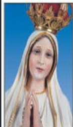
Nuestra Señora de Fátima