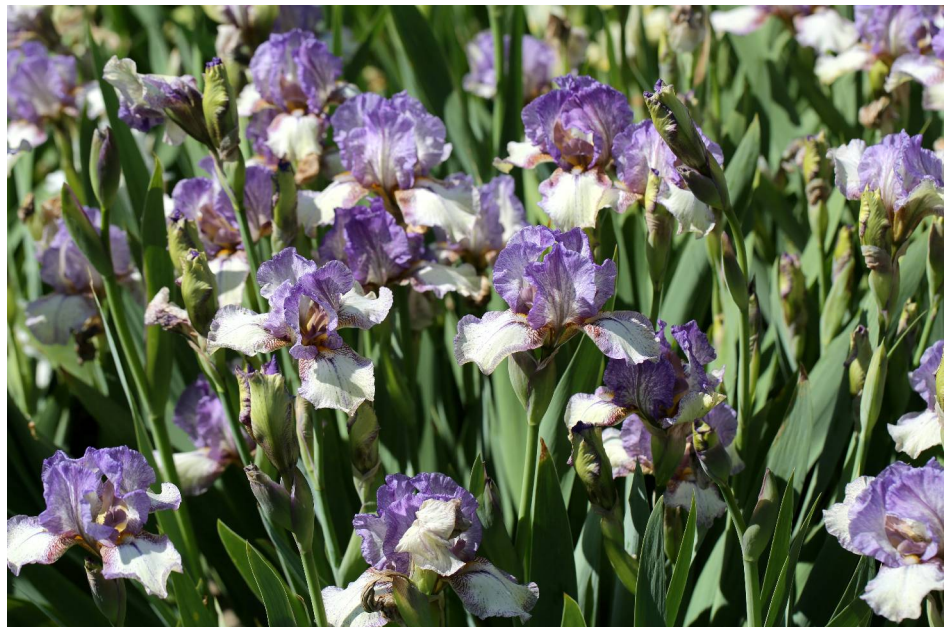
'Jolly Jester' (Willott, 1983) IB

But surviving is not enough. Status draws