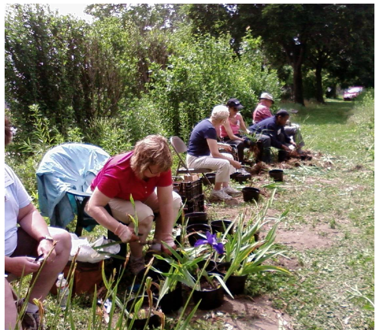
The rescue crew at work

The final rescue effort continued during the 2010 growing season and the new garden was laid out. By the end of the 2010 growing season, all the surviving irises had been dug from among the weeds and first irises were planted in the garden under