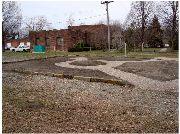
The garden takes shape