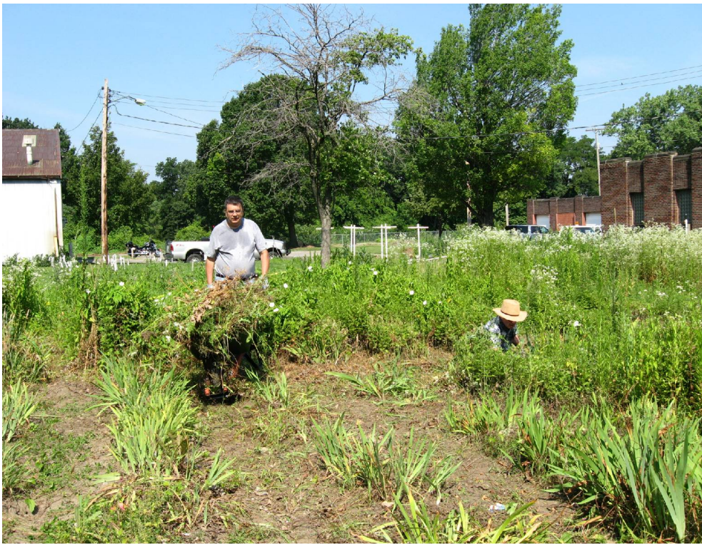
The author with an offering of weeds for the compost pile.