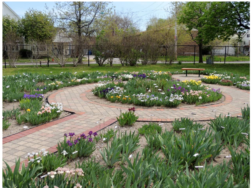
SDBs in bloom

In the last couple of years, volunteers have become few and far between. We would get newly minted Master Gardeners in search of