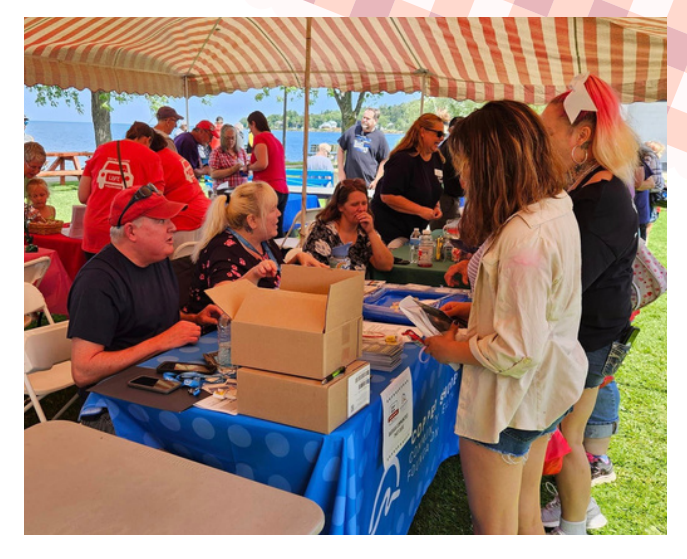
Community enjoying the July 30th Copper Shores Picnic in L'Anse MI