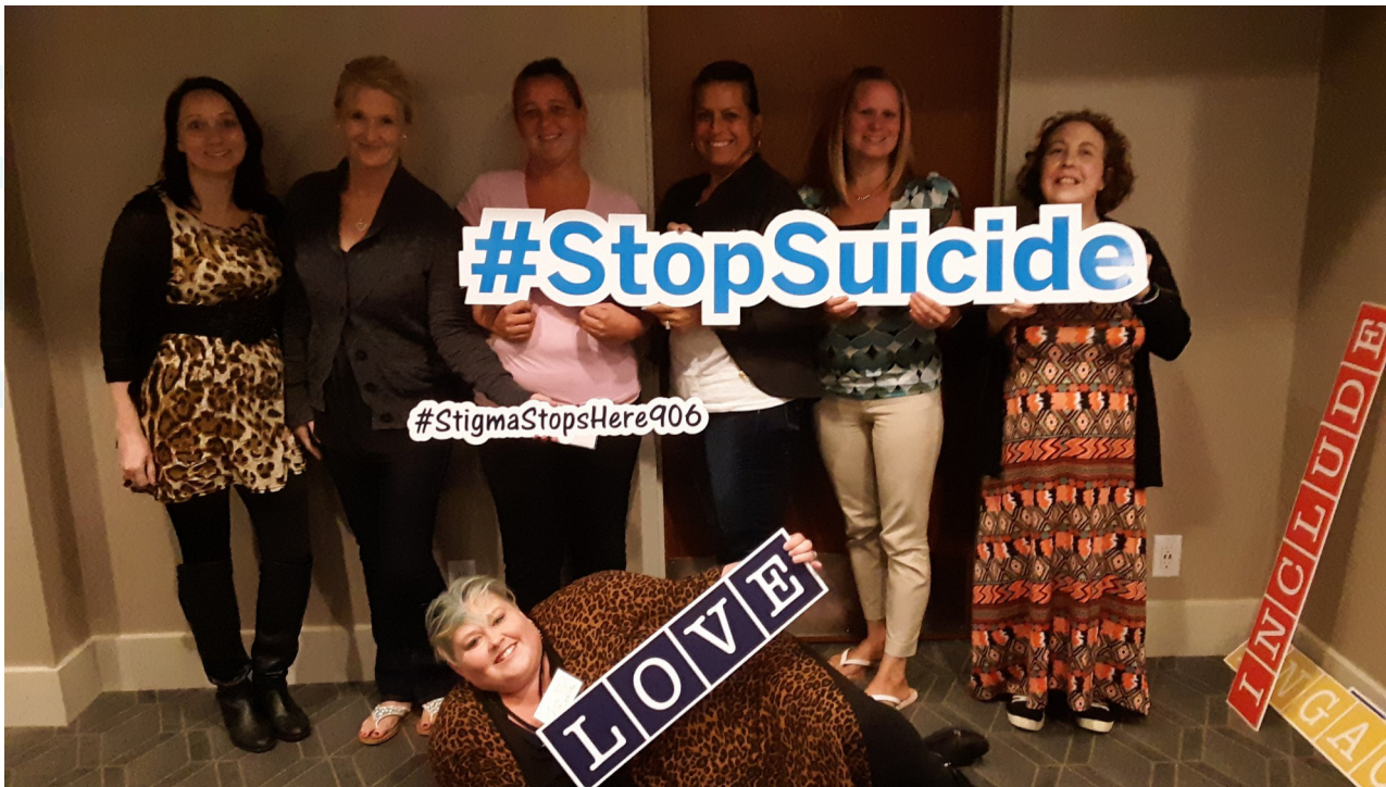
CTC COORDINATORS AT THE FOURTH ANNUAL UP SUICIDE PREVENTION CONFERENCE