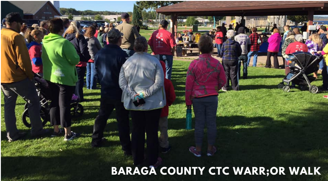
BARAGA COUNTY CTC WARR;OR WALK