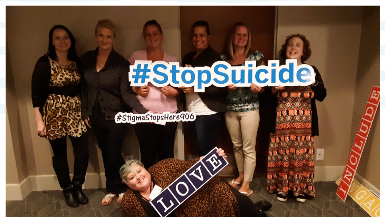
CTC COORDINATORS AT THE FOURTH ANNUAL UP SUICIDE PREVENTION CONFERENCE