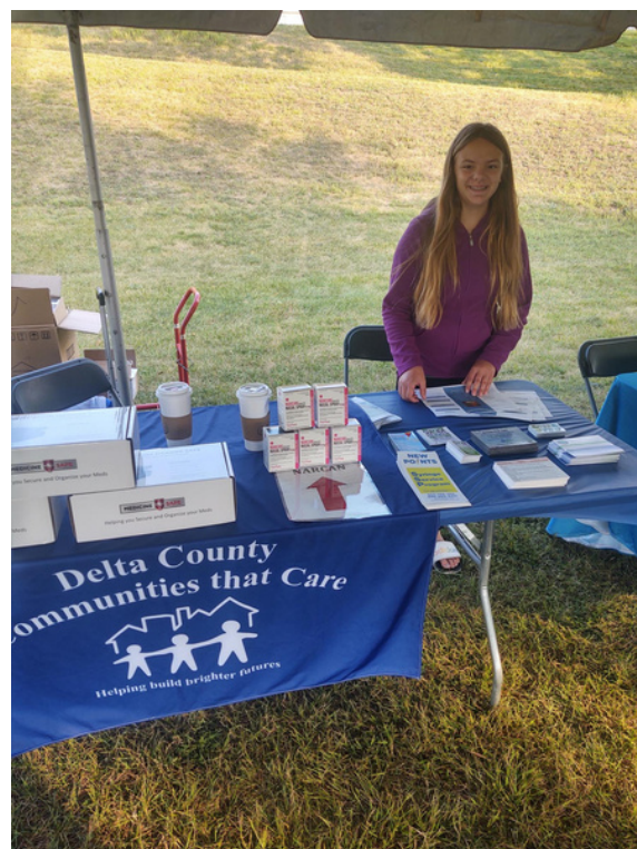
At the End the Silence Suicide Prevention Walk

Our coalition was also excited to announce the arrival of the Narcan vending machine that is being housed in the Delta County Jail lobby. Delta County CTC is excited to partner with the jail to provide the community with access to Narcan 24/7. Delta County CTC members are looking forward to continuing to engaging the youth in our community this fall.