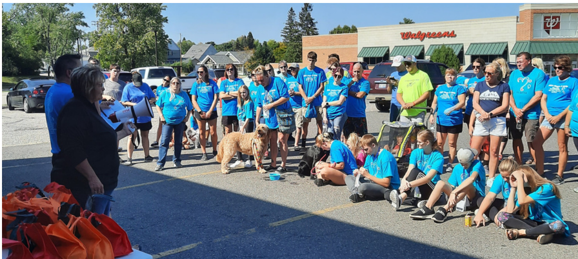
Fourth Annual Hope2Help Suicide Awareness Walk