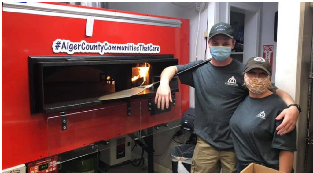
Pizza with a Purpose annual fundraiser held September 23 & 24!

Finally, We held our annual Pizza with a Purpose event at Pictured Rocks Pizza to raise funds for suicide prevention in Alger County. Thank you all to so many who participated in making this year another success. We were able to surpass our goal of $20,000. The outpouring of support for each other in this community is truly overwhelming!!!