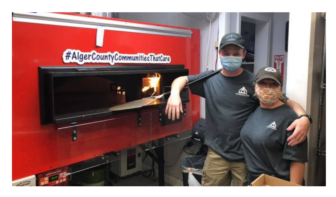
Pizza with a Purpose annual fundraiser held September 23 & 24!

Finally, We held our annual Pizza with a Purpose event at Pictured Rocks Pizza to raise funds for suicide prevention in Alger County. Thank you all to so many who participated in making this year another success. We were able to surpass our goal of $20,000. The outpouring of support for each other in this community is truly overwhelming!!!