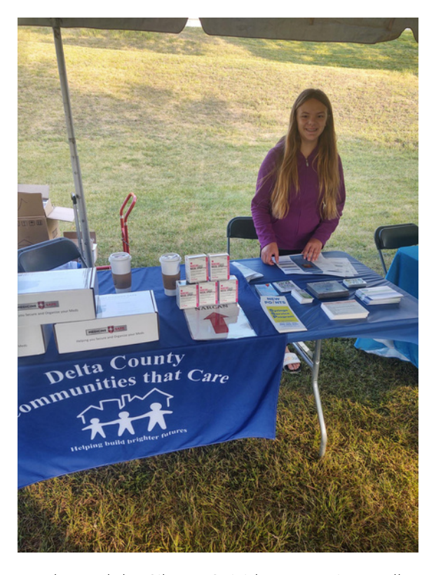
At the End the Silence Suicide Prevention Walk

Our coalition was also excited to announce the arrival of the Narcan vending machine that is being housed in the Delta County Jail lobby. Delta County CTC is excited to partner with the jail to provide the community with access to Narcan 24/7. Delta County CTC members are looking forward to continuing to engaging the youth in our community this fall.