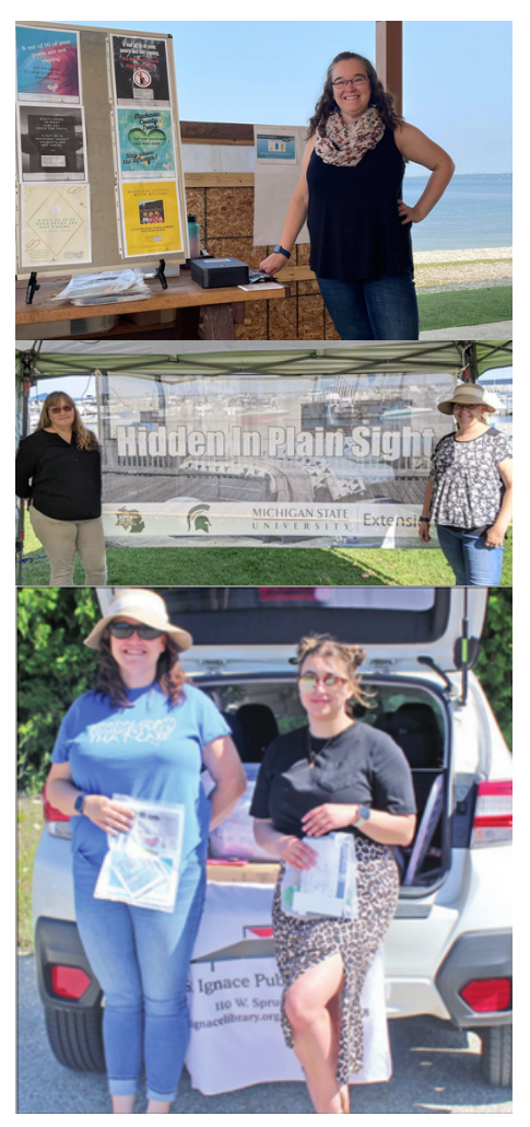
Top: Presenting CTC information at our summer Icecream Social.

We wrapped up the summer in September at the Mackinac Co Wellness Coalition's resource fair with 19 other organizations promoting the message of mental health and resiliency. We saw about 185 people attend the fair and the CTC was there with all our resources and promoting our partnership with the EUP Hidden In Plain Sight Trailer.