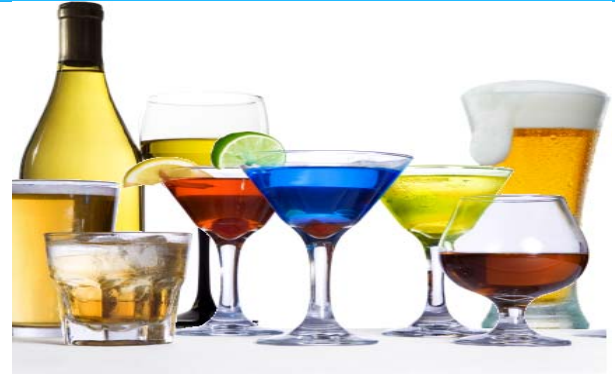
Driving after Drinking

“Nondrinkers” didn’t drink any alcohol in the past 30 days. “Current drinkers” had at least one drink of alcohol in the past 30 days. “Youth” are 9th-12th grade students attending Michigan public high schools.