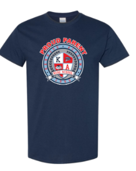
Proud Parent T-Shirt $25

Proud Grandparent V-Neck T-Shirt (not shown)