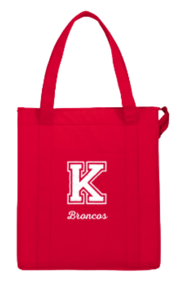
Red Bronco Insulated Tote