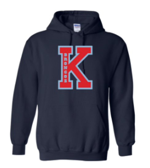
Block K Hoodie Sweatshirt $45