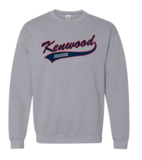
Kenwood Tail Crewneck Sweatshirt $40