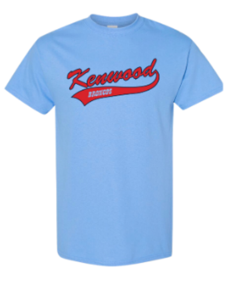
Kenwood Tail T-shirt $20