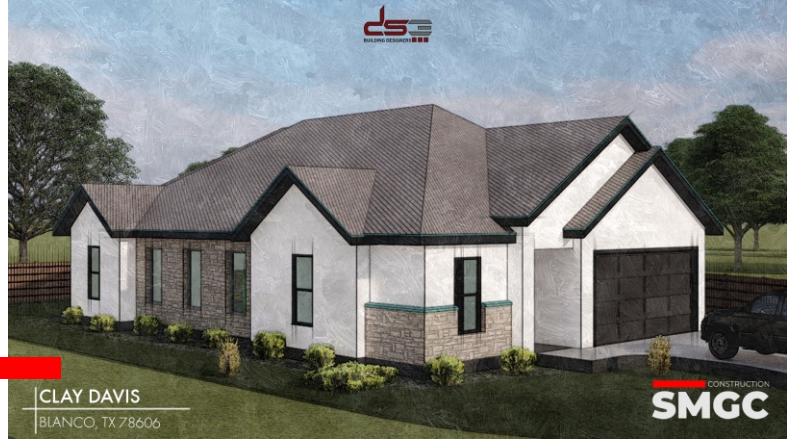
CLAY DAVIS BIANCO, TX 78606