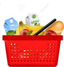
Food Inflation (Y-o-Y)