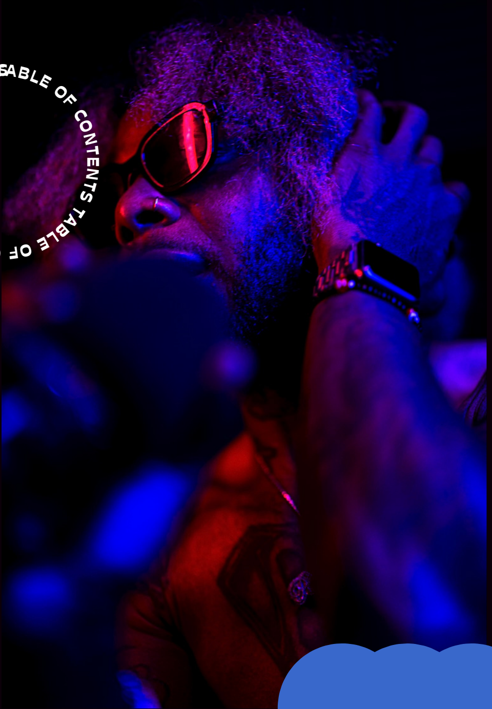
Pictured Artist: Himm

TABLE OF CONTENTS TABLE OF CONTENTS TABLE OF CONTENTS TABLE OF CONTENTS TABLE OF CONTENTS