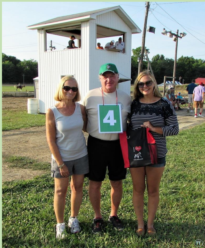
A Knight and two Ladies.

But the Fans were worth it as comments such as “I’ve never, ever enjoyed myself at the races like this” and everyone was felt welcomed.