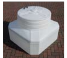
Tank & Dispenser Sumps