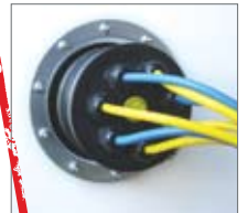
Pipe & Cable Entry Boot