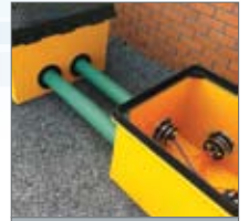
Electrical Draw Pits

FlexRite the newly EN14125 approved flexible pipework system for pressure and suction applications upon petrol filling stations. The range consists of 1 1/2", 2" and 3" single and double wall flexible pipework on reels. Pipe construction uses a nylon outer barrier layer with a polyethylene body and a Kynar PVDF barrier layer for the primary pipe to ensure compatibility with a broad range of petroleum and other products. The secondary jacket is again protected with a nylon barrier and consists of a polyethylene jacket with standoff legs. Terminations and interconnections are created using well proven internally swaged stainless steel couplings which are available in both fixed thread and swivel nut variants. Pump riser connection are provided by tee and elbow fittings.