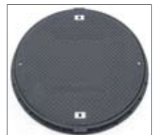
Composite Manhole Covers