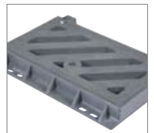
Composite Gully Grates