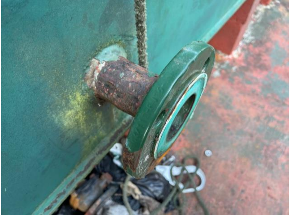
Fig 7. Tank Supports & Base