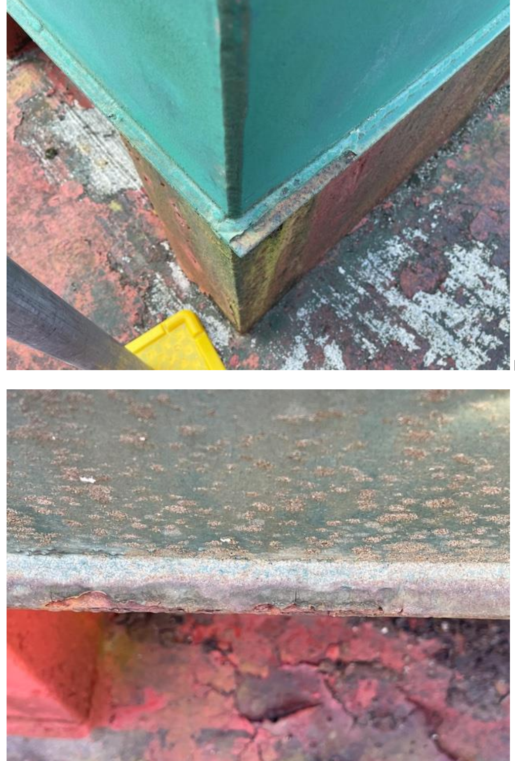
Fig 11. Protrusion Corrosion

Location: SAMPLE Item(s) Inspected: SAMPLE Date of Inspection: SAMPLE Page 18 of 31