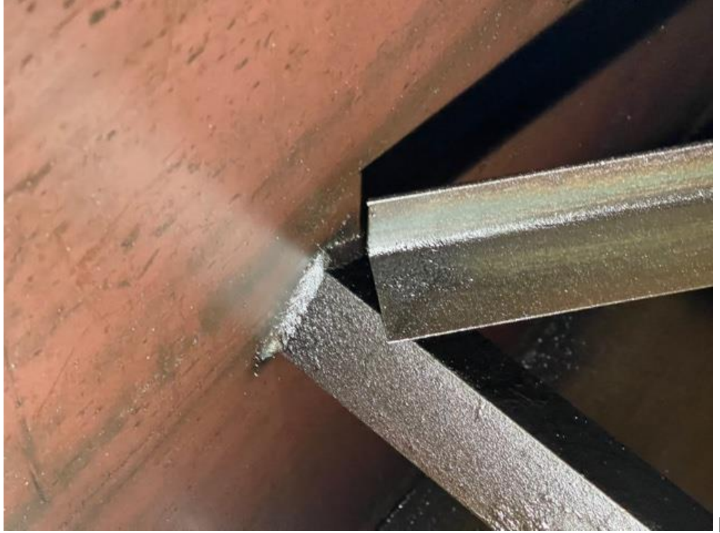
Fig 28. Unwelded Bracing