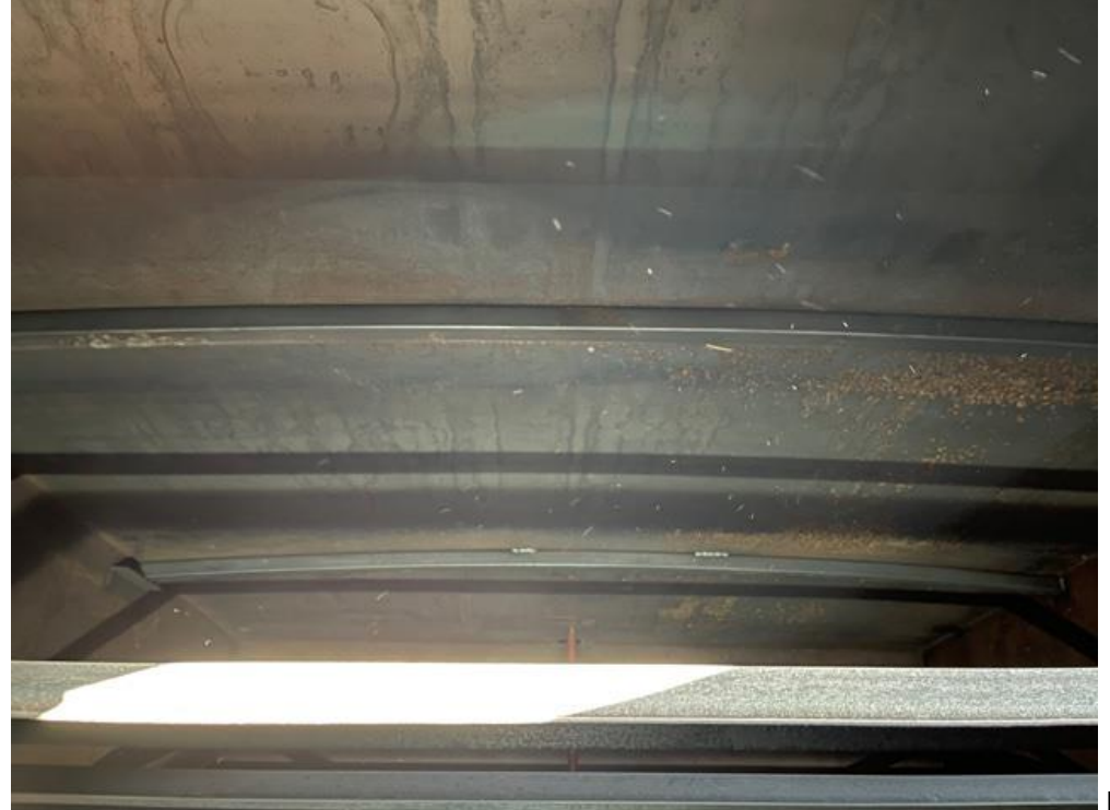
Fig 20. Tank Floor