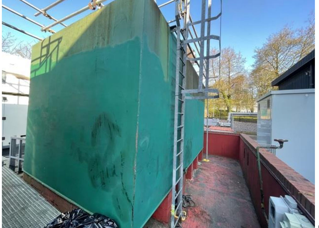
Fig 3. Exterior from North East