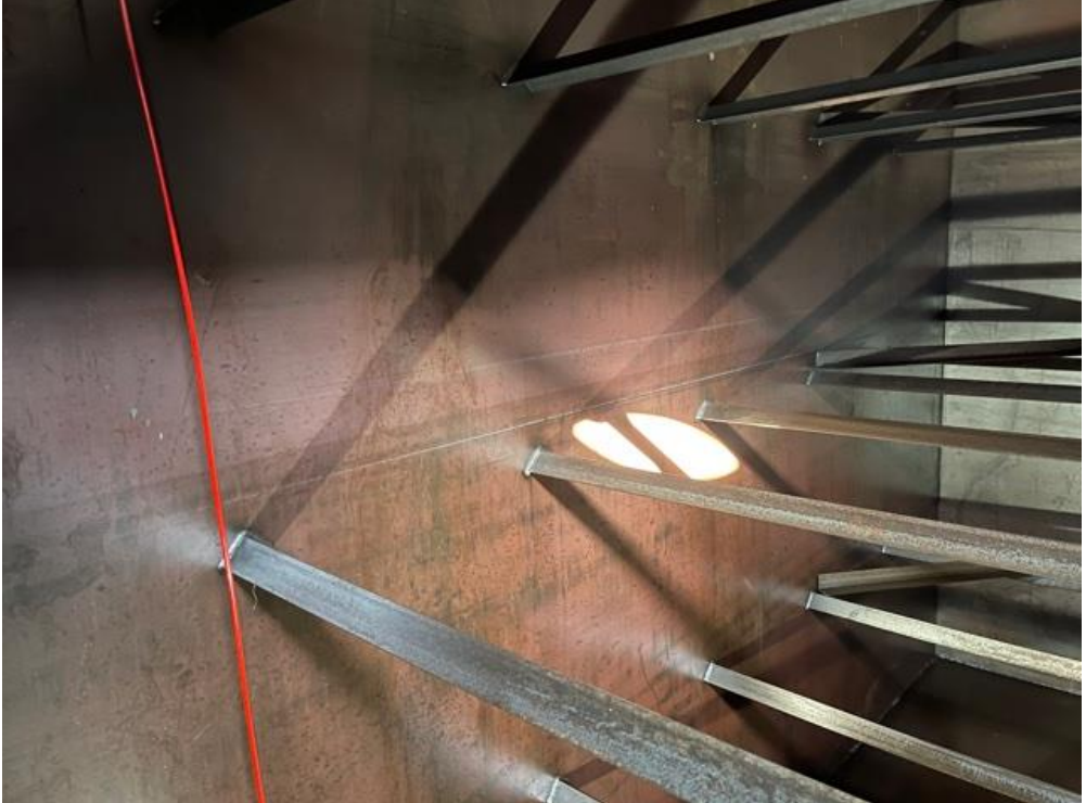
Fig 22. Tank East Wall