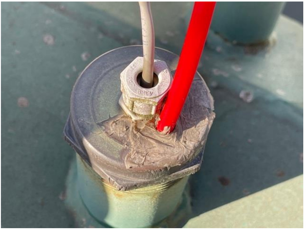
Fig 15. Gauge Pipe Inlet

Location: SAMPLE Item(s) Inspected: SAMPLE Date of Inspection: SAMPLE Page 20 of 31