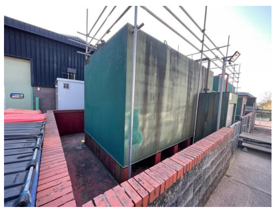
Fig 2. Exterior from North West