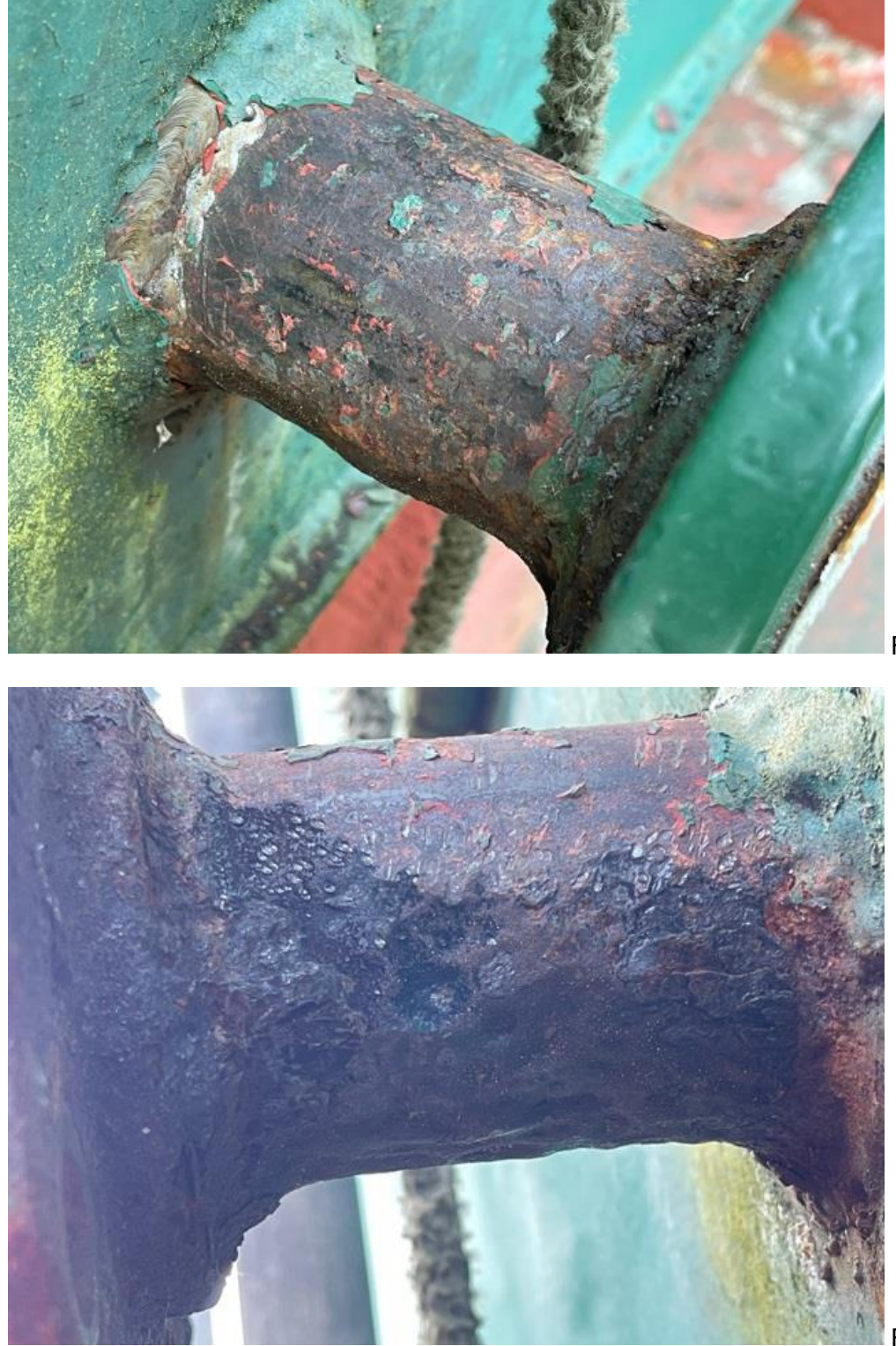
Fig 9. Outlet Nozzle Close-Up

Location: SAMPLE Item(s) Inspected: SAMPLE Date of Inspection: SAMPLE Page 17 of 31