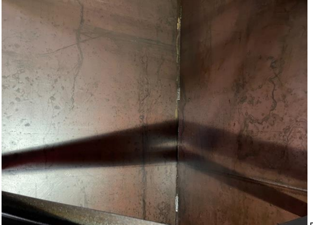
Fig 26. Outlet Close-Up