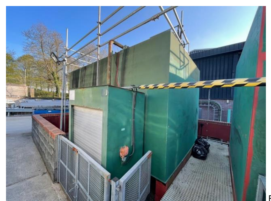
Fig 1. Exterior from South West