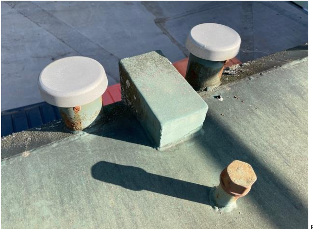
Fig 17. Tank Vents & Dip

Location: SAMPLE Item(s) Inspected: SAMPLE Date of Inspection: SAMPLE Page 21 of 31