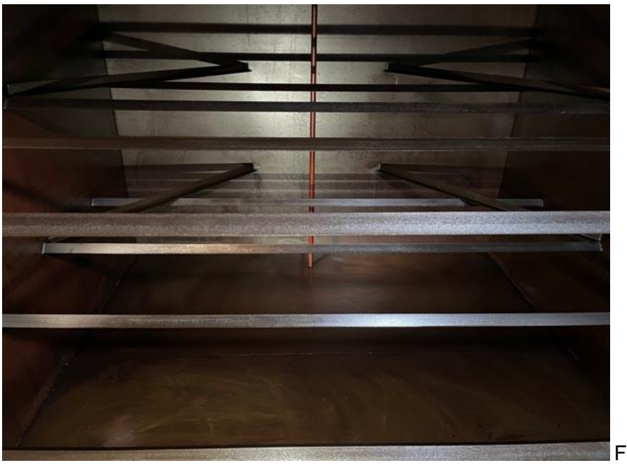
Fig 18. Central Internal View