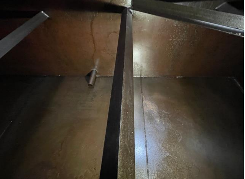
Fig 24. S/W Floor & Gauge