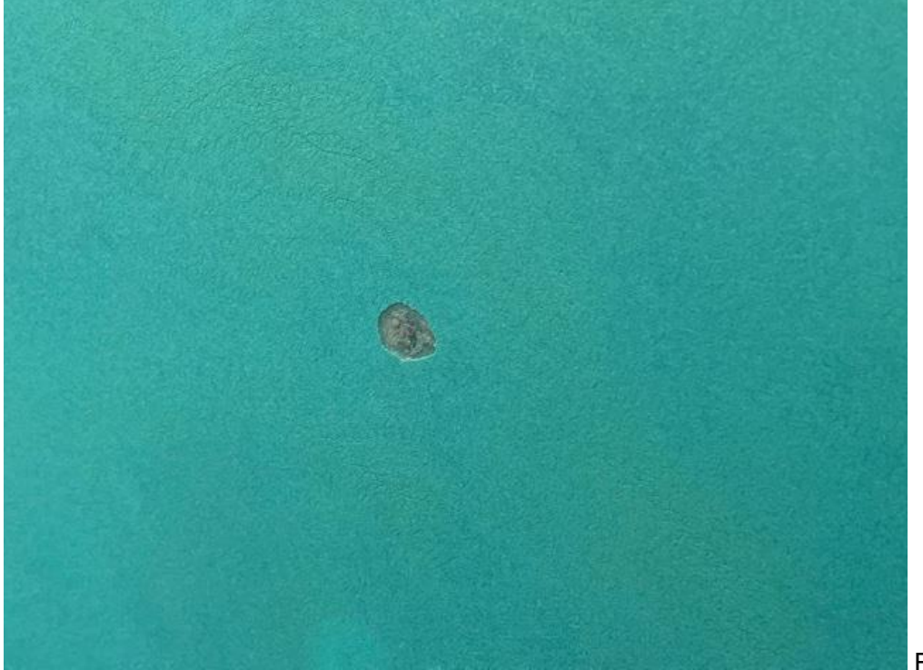
Fig 13. Protrusion Corrosion