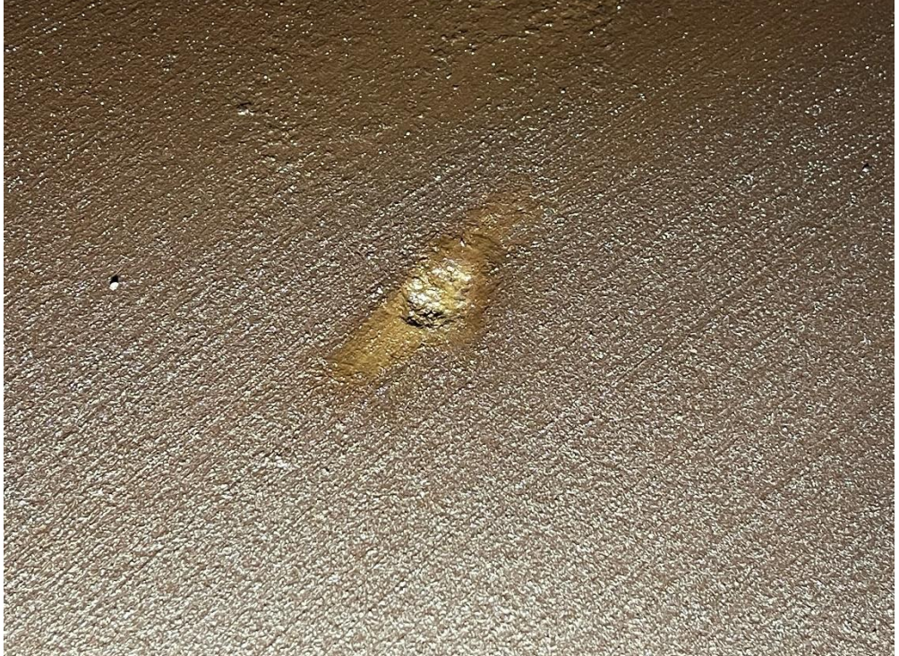
Fig 30. N/W Floor Pitting