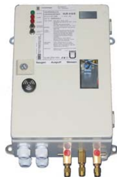
P: weather-proof design

An underpressure leak detector for the continuous monitoring of double-walled pipes.