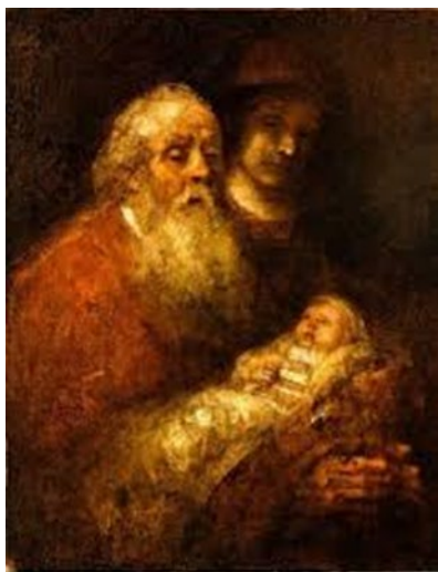
Rembrandt's "Simeon and Anna"

So bring him incense, gold, and myrrh; come, peasant king, to own him. The King of kings salvation brings; let loving hearts enthrone him. Raise, raise the song on high, the virgin sings her lullaby; joy, joy, for Christ is born, the babe, the son of Mary!