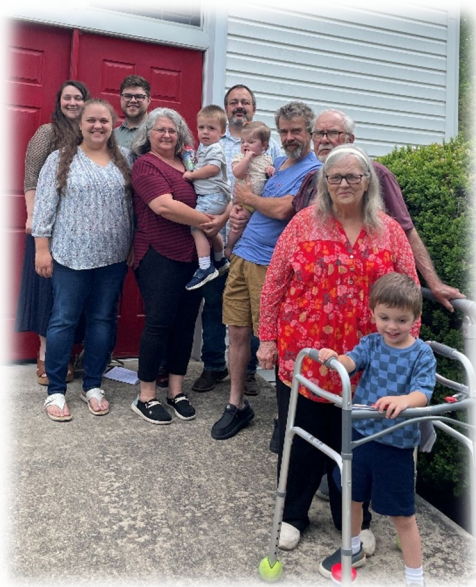
The Moomaws & Allison's!