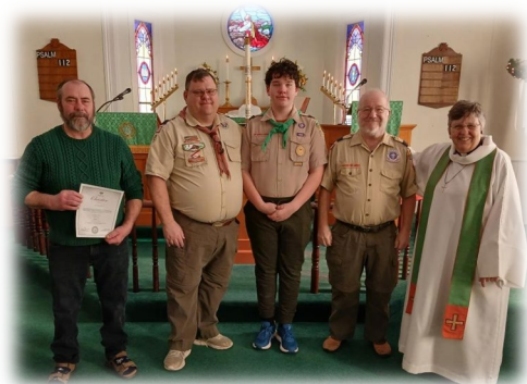
Scout Sunday - February 8

The grace of our Lord Jesus Christ, the love of God, and the communion of the Holy Spirit be with you all. And also with you.