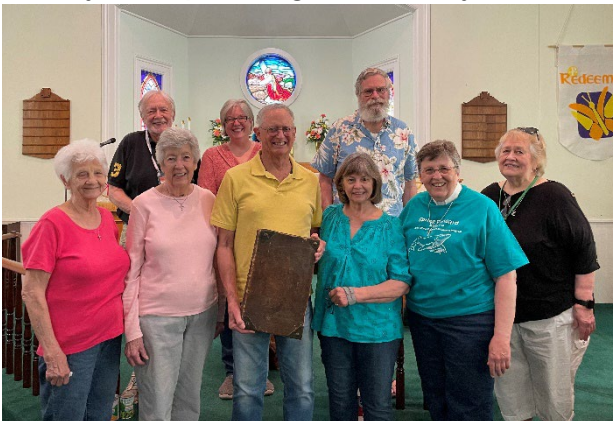
Reception of the 1798 German Bible

water and the Word; that you nourish our souls with your body and blood, let us pray to the Lord, let us pray to the Lord... Refrain