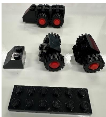
Place wheels & slope on plate.