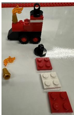
Attach cone & flame on front stud, then stack these plates and lifting ring on back studs.