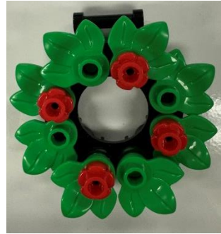
Attach 2 nd layer on little round plates, then add red flowers.