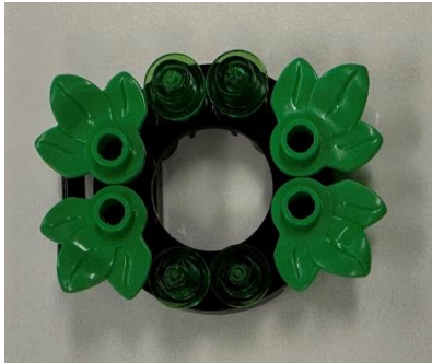
Attach 1 st layer of leaves.