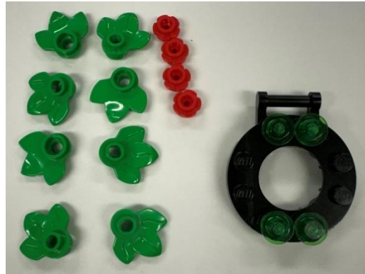
Place handle behind and round places on top.