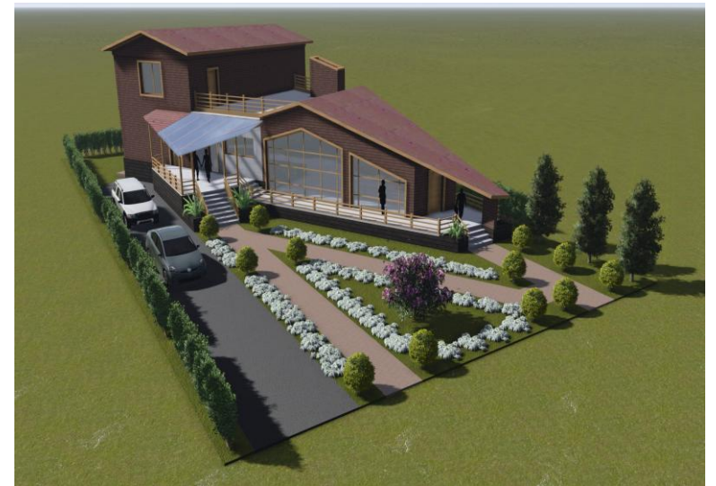
Almaty Weekend House