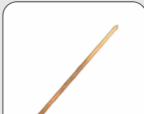
LIGHTNING ARRESTER & EARTHING KIT