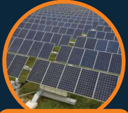
MW Scale Project