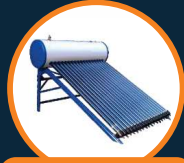
Solar Water Heater