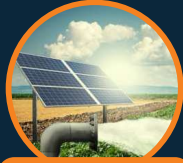
Solar Water Pump