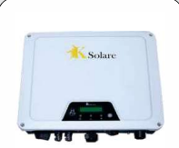
ON GRID INVERTER