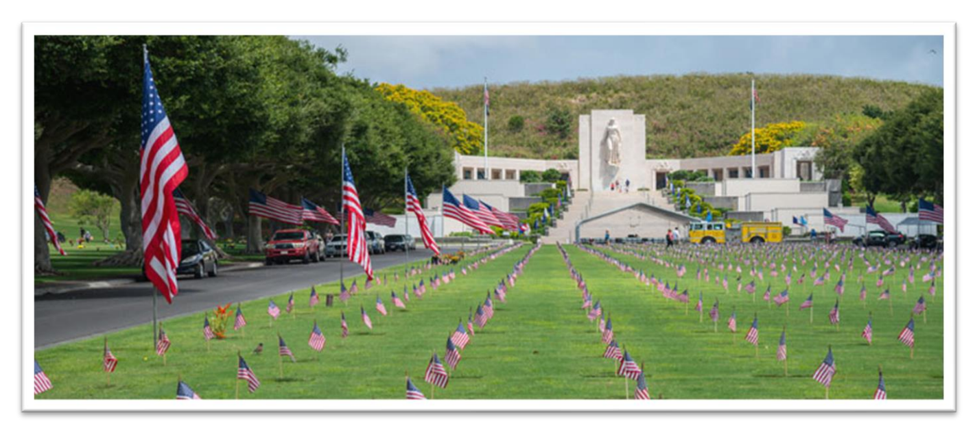
In remembrance of our heroes this Memorial Day.

Hoping you had a meaningful Memorial Day weekend.