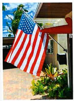
Properly displayed American Flag on Koko Isle.

Koko Isle House Rules: Pg. 8, 4. Carports: A flagpole may be erected in the ground-level privacy area, or a bracket may be attached to the carport post by the mailbox. Properly displayed American Flags are allowed at all times under the Freedom to Display the American Flag Act of 2005. In addition, a Hawaiian state flag may be flown in accordance with the American flag protocol.