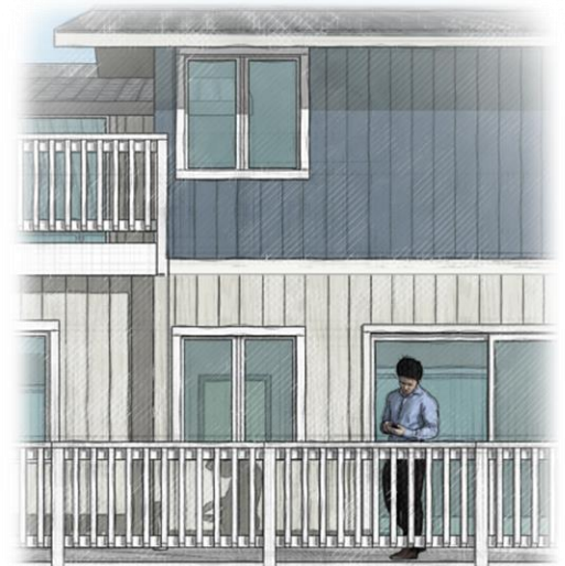
Rendering sample of approved railing design.

Also, inspect all trees and vegetation in your privacy areas that need trimming away from or removal from the building for painting.