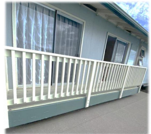
Example of approved railing design.

See the resident manager for specifications for the approved balcony / deck railing design. Ropes are no longer allowed on Koko Isle railings as it does not conform to current Building Codes and therefore should be replaced. The Resident Manager and Building & Grounds Committee will inspect all railings and advise residents of those not in compliance. Also, inspect all trees and vegetation in your privacy areas that need trimming away from or removal from the building for painting.