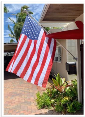
Properly displayed American Flag on Koko Isle.

Koko Isle House Rules: Pg. 8, 4. Carports: A flagpole may be erected in the ground-level privacy area, or a bracket may be attached to the carport post by the mailbox. Properly displayed American Flags are allowed at all times under the Freedom to Display the American Flag Act of 2005. In addition, a Hawaiian state flag may be flown in accordance with the American flag protocol.