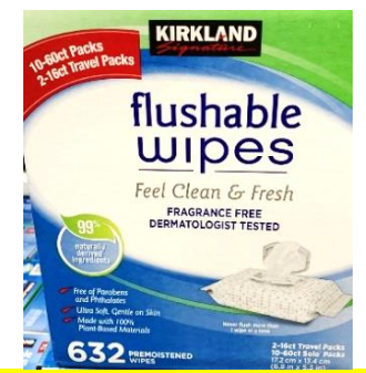
These are NOT flushable!

Helpful Hints to protect your sewer lines from backing up. Our sewer lines are over 50 years old and can easily get clogged, so with proper preventive care, we can stop many mishaps.