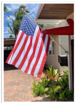
Properly displayed American Flag on Koko Isle.

Koko Isle House Rules: Pg. 8, 4. Carports: A flagpole may be erected in the ground-level privacy area, or a bracket may be attached to the carport post by the mailbox. Properly displayed American Flags are allowed at all times under the Freedom to Display the American Flag Act of 2005. In addition, a Hawaiian state flag may be flown in accordance with the American flag protocol.