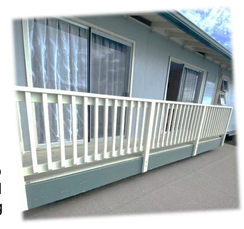
Example of approved railing design.

See the resident manager for specifications for the approved balcony / deck railing design. Ropes are no longer allowed on Koko Isle railings as it does not conform to current Building Codes and therefore should be replaced. The Resident Manager and Building & Grounds Committee will inspect all railings and advise residents of those not in compliance. Also, inspect all trees and vegetation in your privacy areas that need trimming away from or removal from the building for painting.