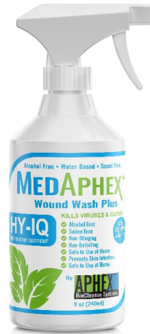
MedAphex Wound Wash