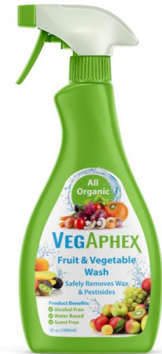
VegAphex Fruit and vegetable wash

Additional Brand Products for your business Email us: info@freedomxsanitizer.com