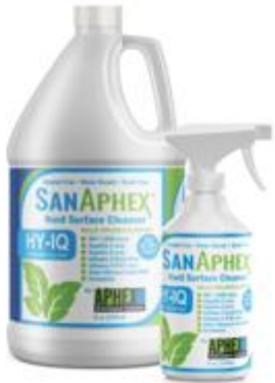
SanAphex Hard Surface Cleaner