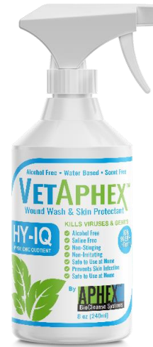
VetAphex Use for cuts on pets