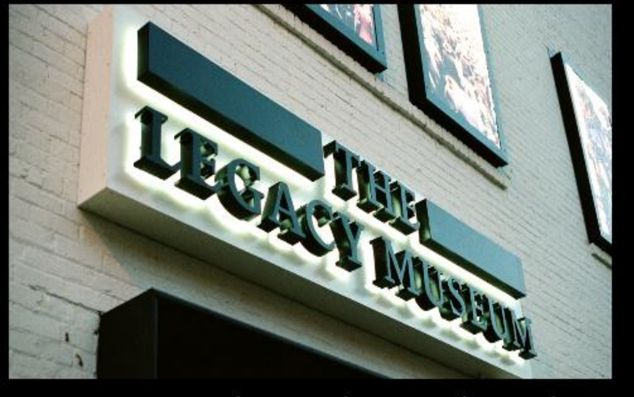
Legacy Museum and National Memorial Named Alabama Tourism's 2019 Attraction of the Year