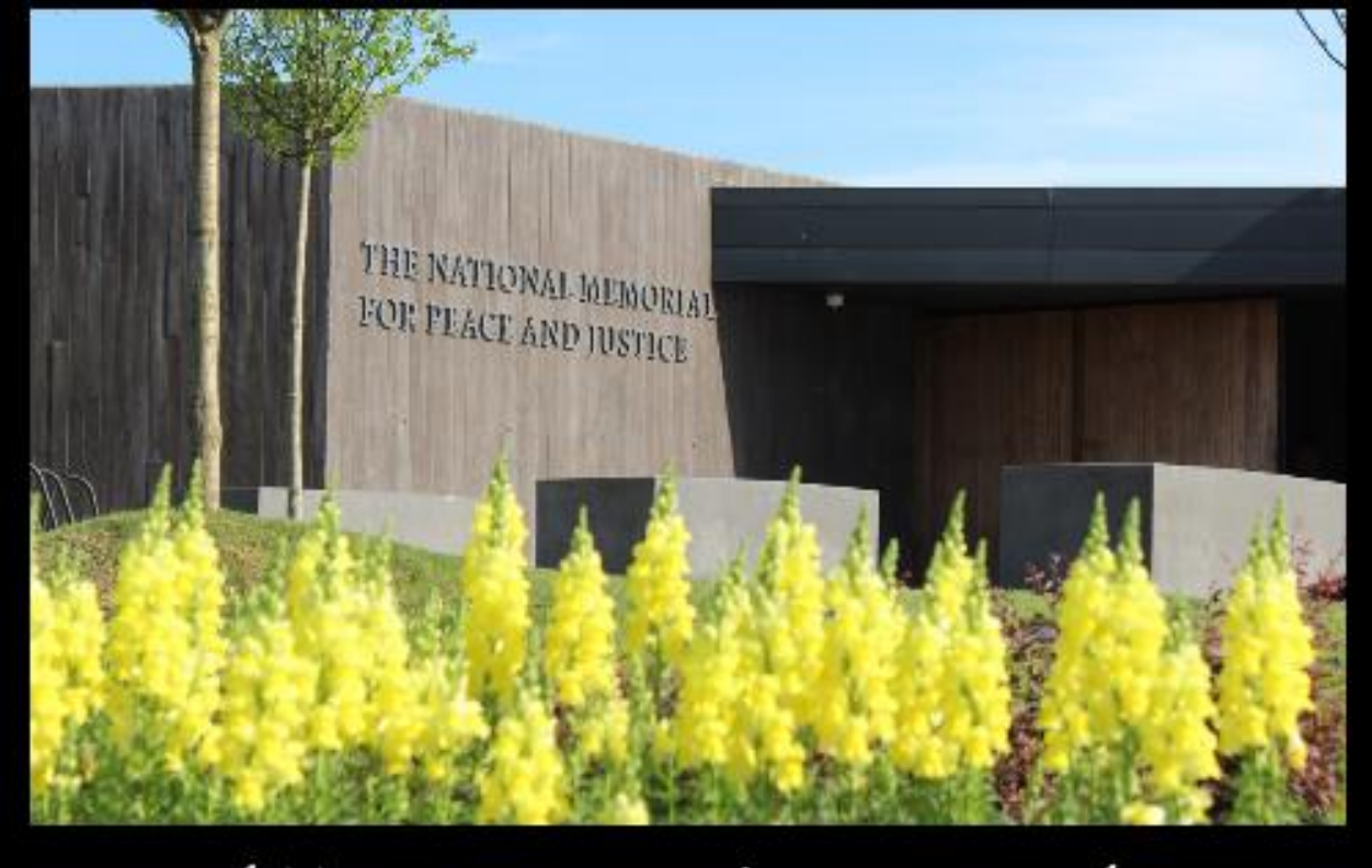
New York Times Reports EJI's Museum and Memorial Are Revitalizing Montgomery