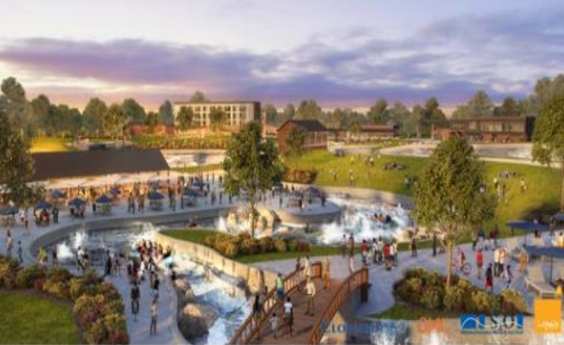
A whitewater park and outdoor center in downtown Montgomery will include a beer garden, a hotel, restaurants, shops and more.