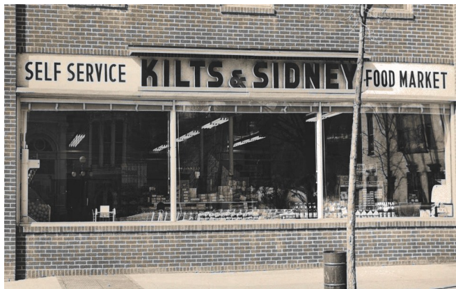
A blast from the past: Food Market on Main Street 1950's

Help Needed: The Schoharie American Legion Auxiliary will be putting American flags on Veteran graves in the Lutheran Cemetery on Tuesday, May 17th beginning at 10 am. It usually takes an hour or so but depends on the number of volunteers (unfortunately the 6th grade students cannot help this year). If you can help, just show up. Note: Do not wear sandals — some type of boots are better. The ground can still be wet. Thank you in advance for any help you can give.